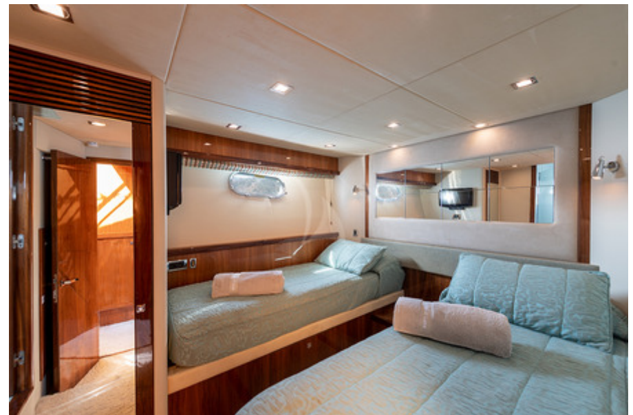
CALA DI LUNA - Twin cabin convertible to double