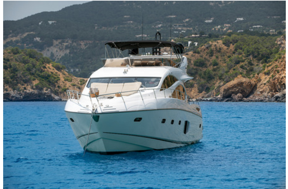
CALA DI LUNA - At anchor