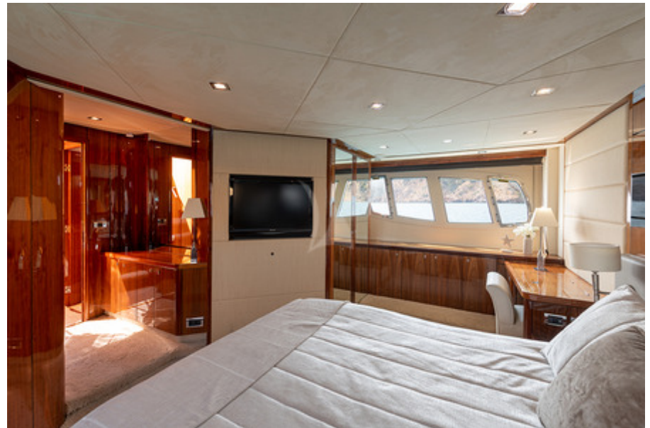
CALA DI LUNA - Master Cabin