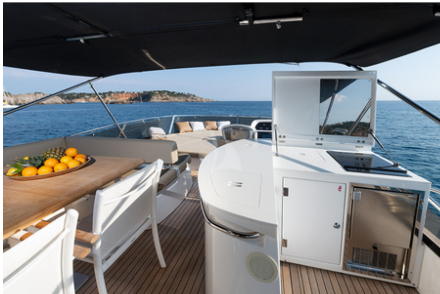
CALA DI LUNA - Flybridge Teppanyaki detail