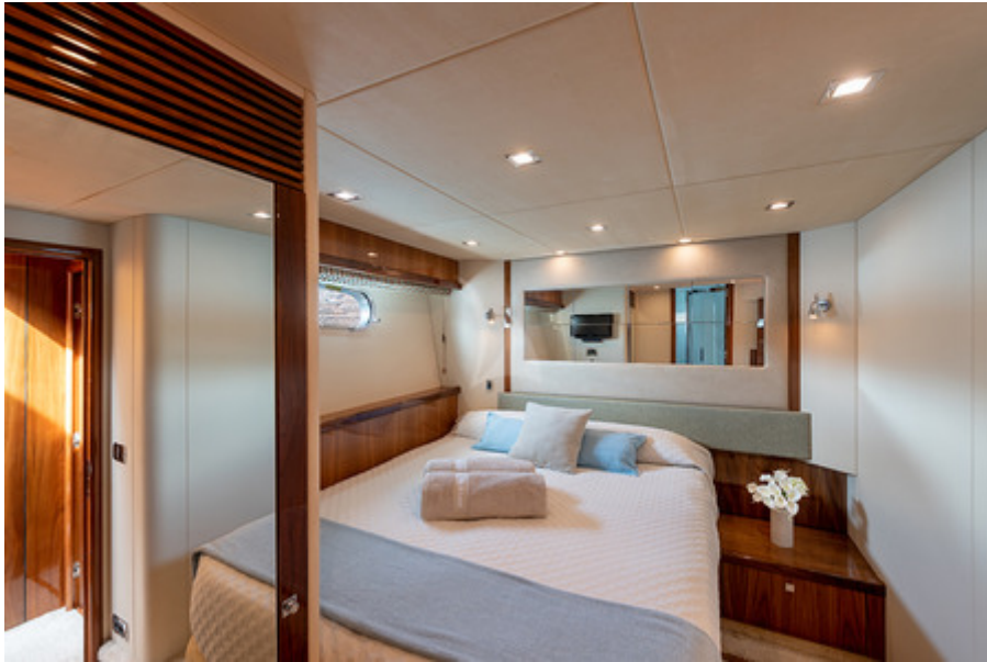
CALA DI LUNA - Twin cabin converted to double