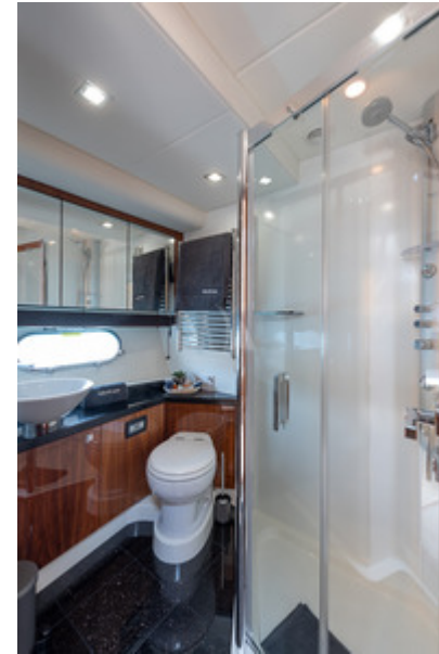
CALA DI LUNA - Master bathroom