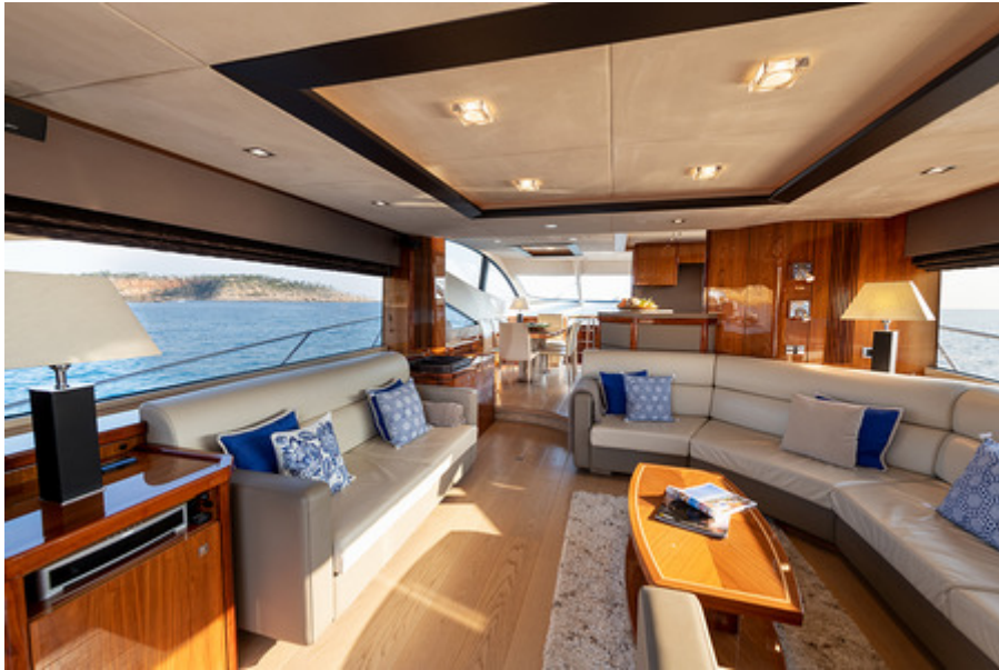
CALA DI LUNA - Salon