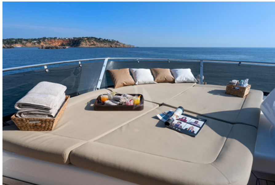
CALA DI LUNA - Flybridge solarium