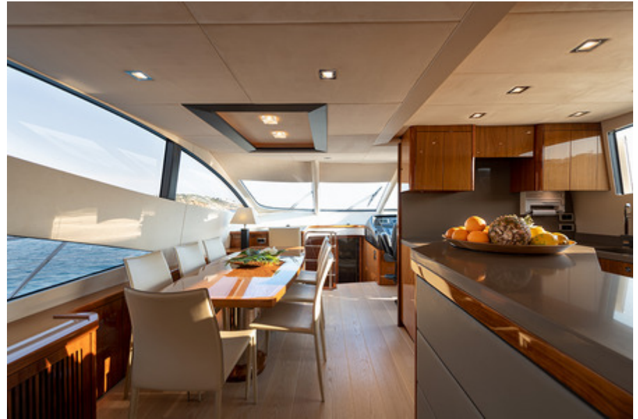
CALA DI LUNA -Living room dining detail