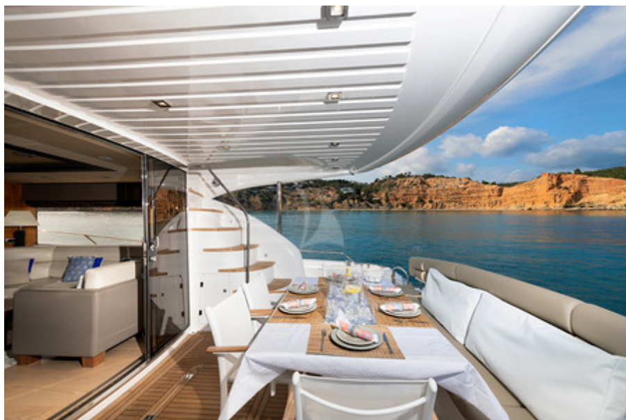
CALA DI LUNA - Aft main deck