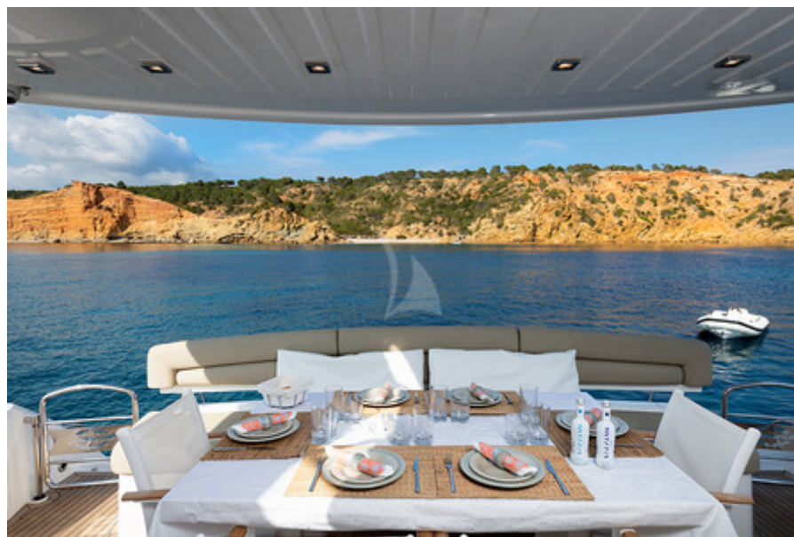
CALA DI LUNA - Aft main deck