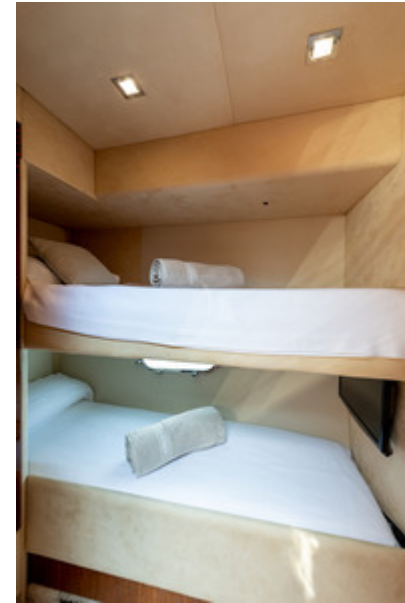
CALA DI LUNA - Bunk cabin