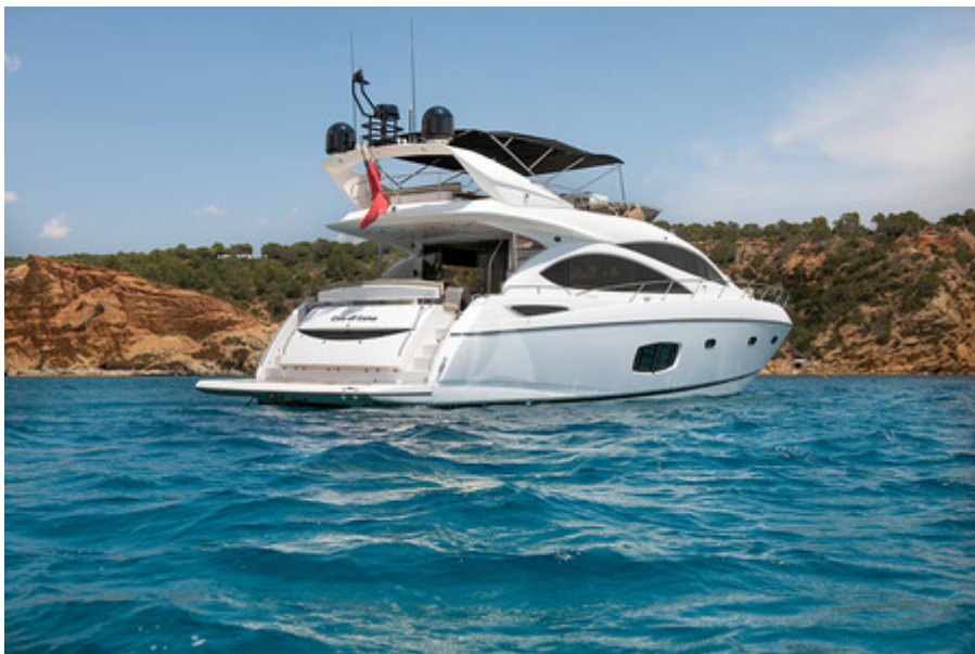
CALA DI LUNA - At anchor