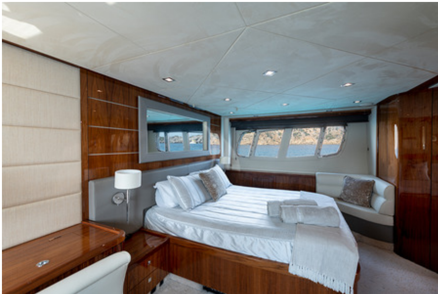
CALA DI LUNA - Master Cabin