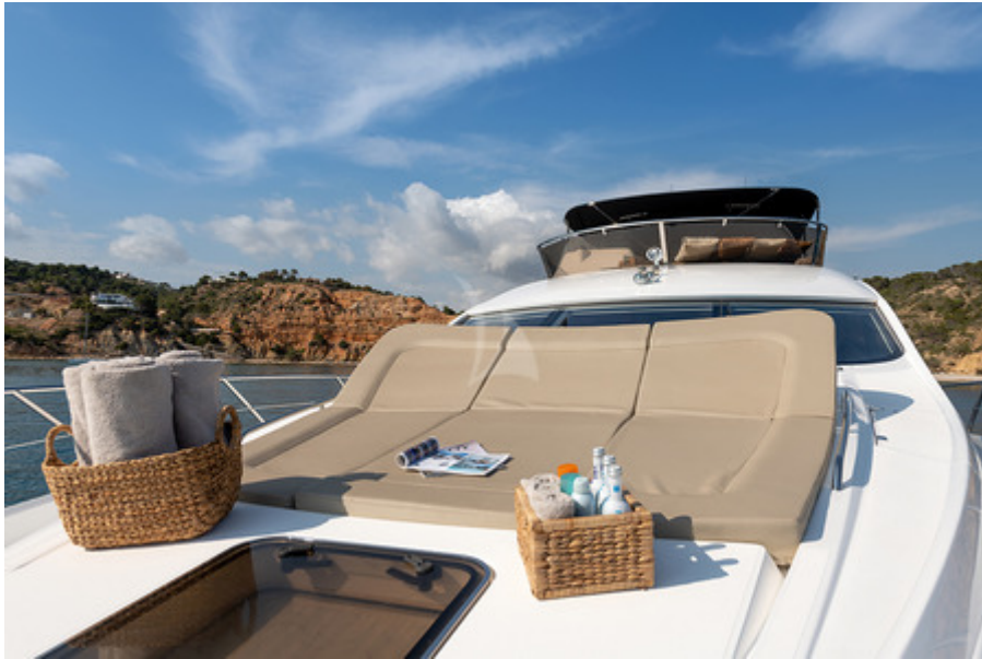
CALA DI LUNA - Bow solarium