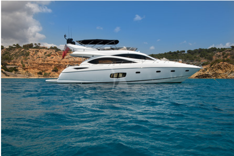
CALA DI LUNA - At anchor