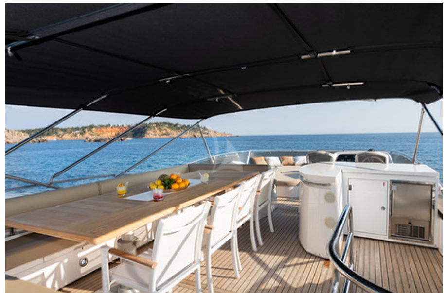
CALA DI LUNA - Flybridge