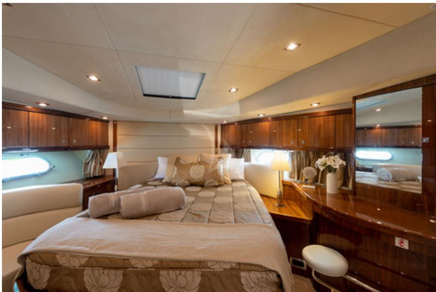
CALA DI LUNA - VIP cabin