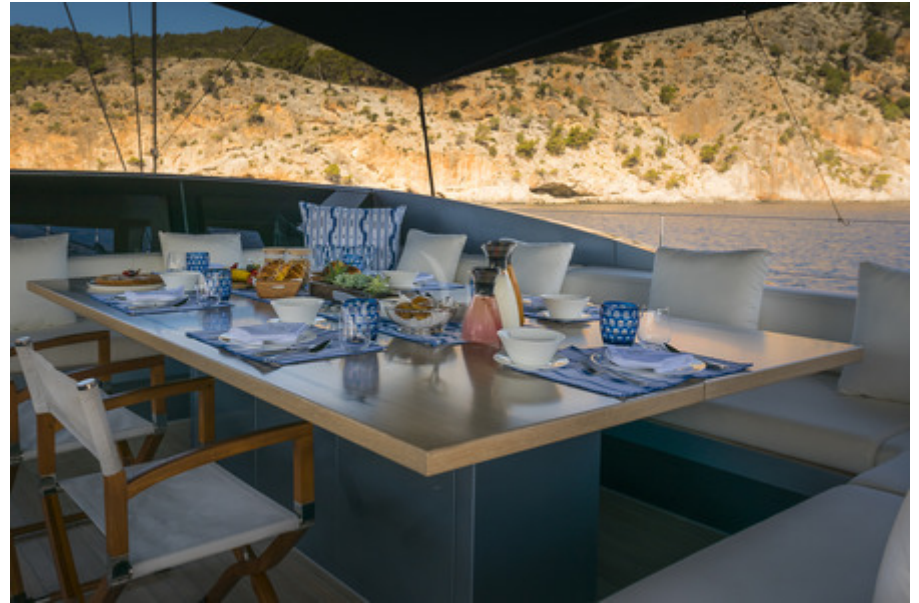
Al fresco dining table