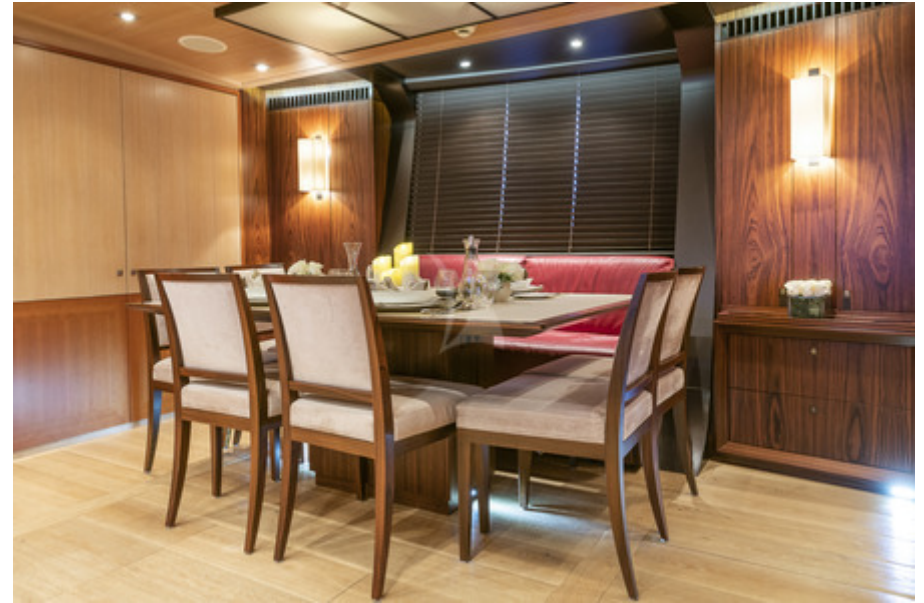
Formal dining table