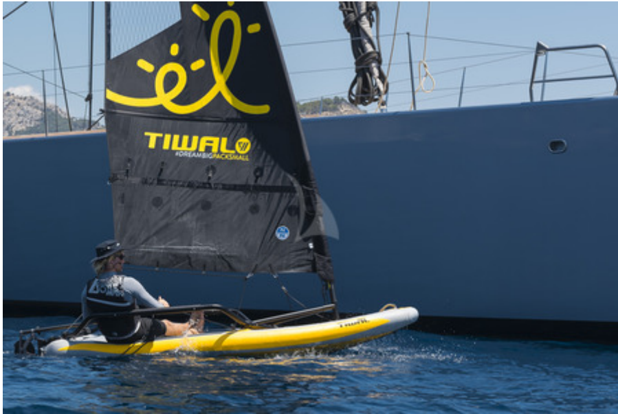
Inflatable sailing dinghy