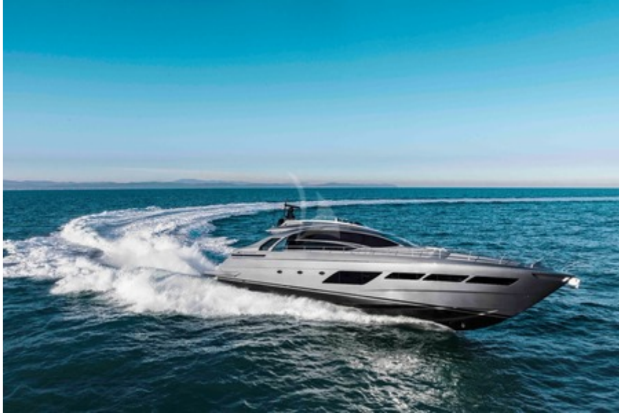
BEYOND - At sailing