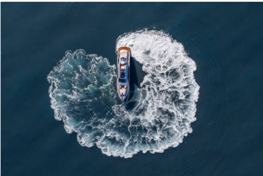
BEYOND - At sailing