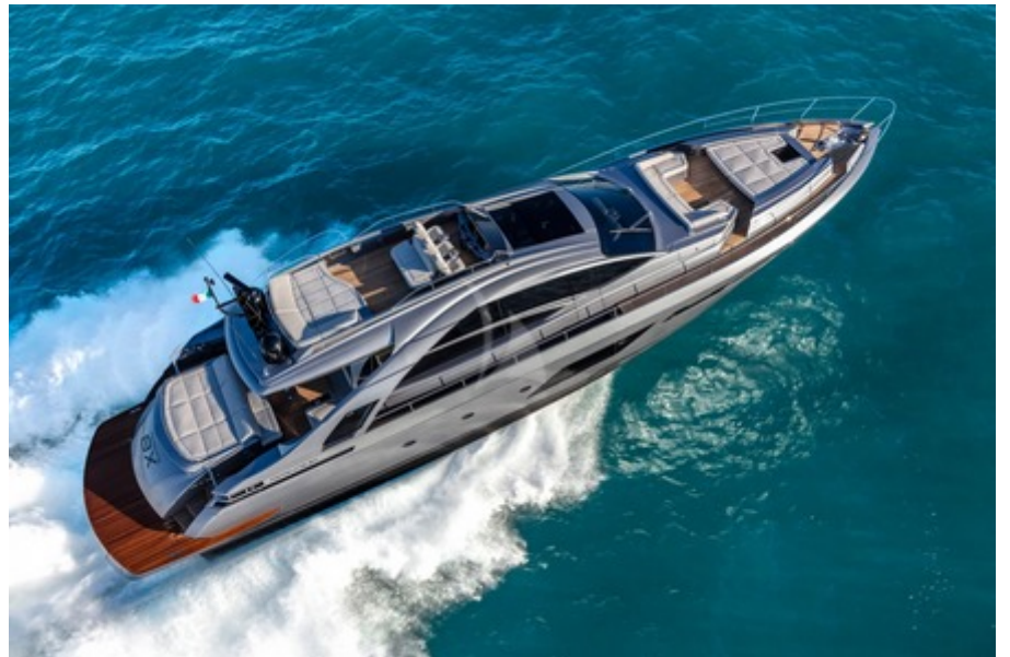
BEYOND - At sailing