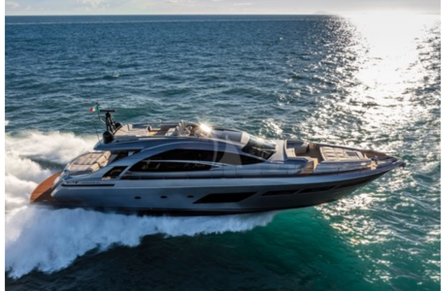
BEYOND - At sailing