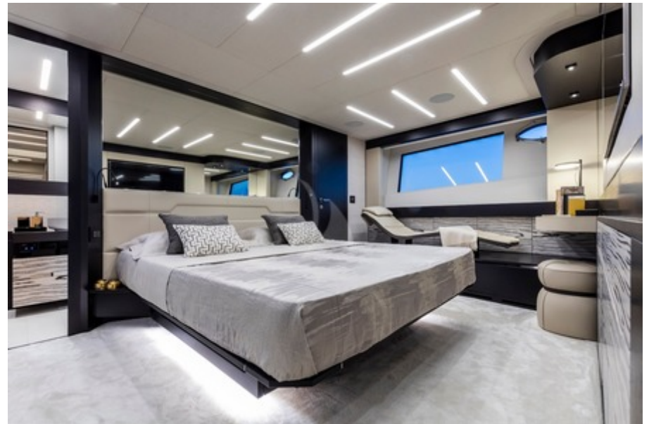
BEYOND - Master cabin