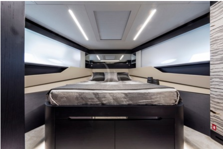
BEYOND - VIP cabin