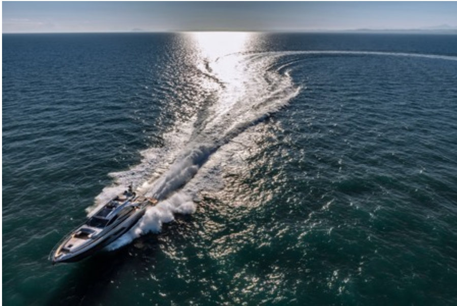
BEYOND - At sailing