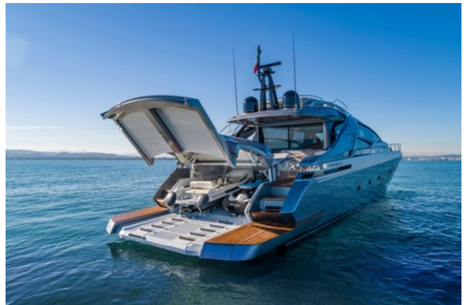
BEYOND - Stern