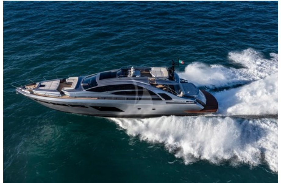
BEYOND - At sailing