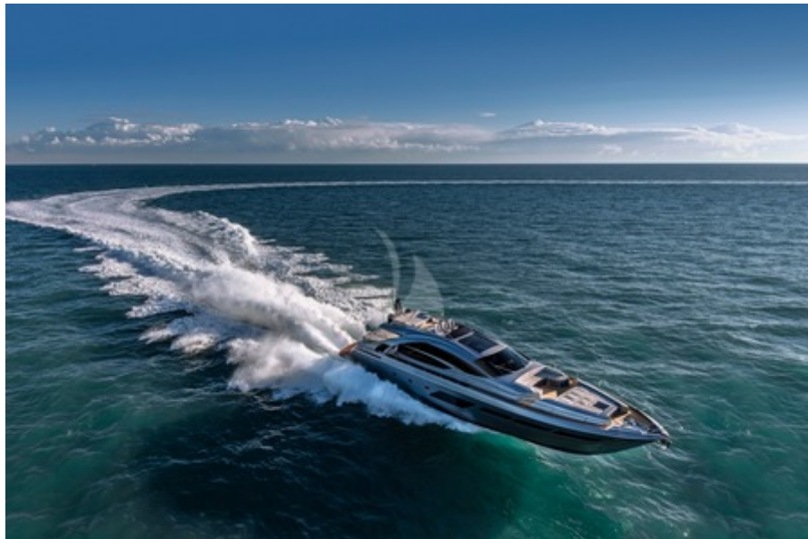
BEYOND - At sailing