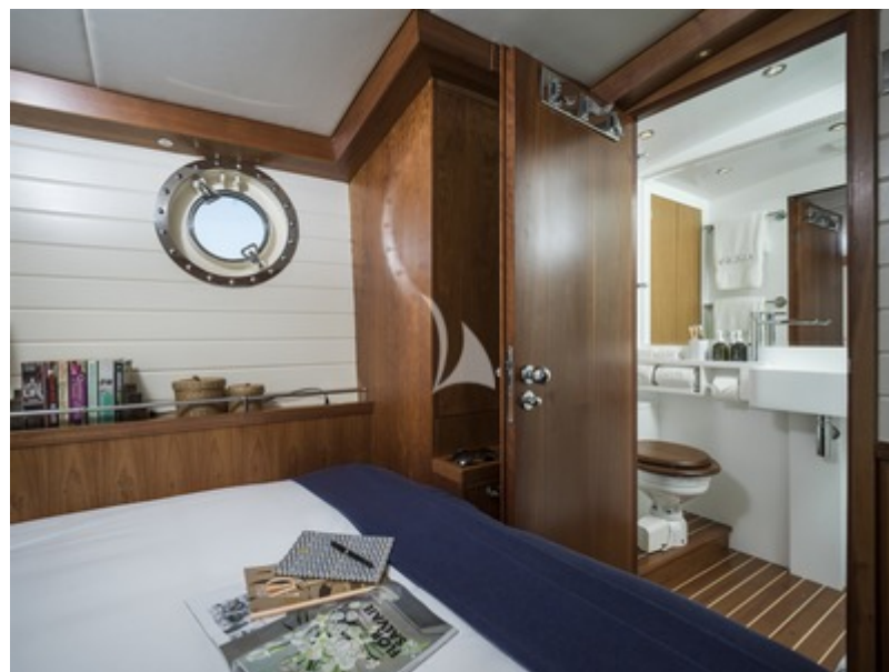
Double/Twin Cabin Ensuite