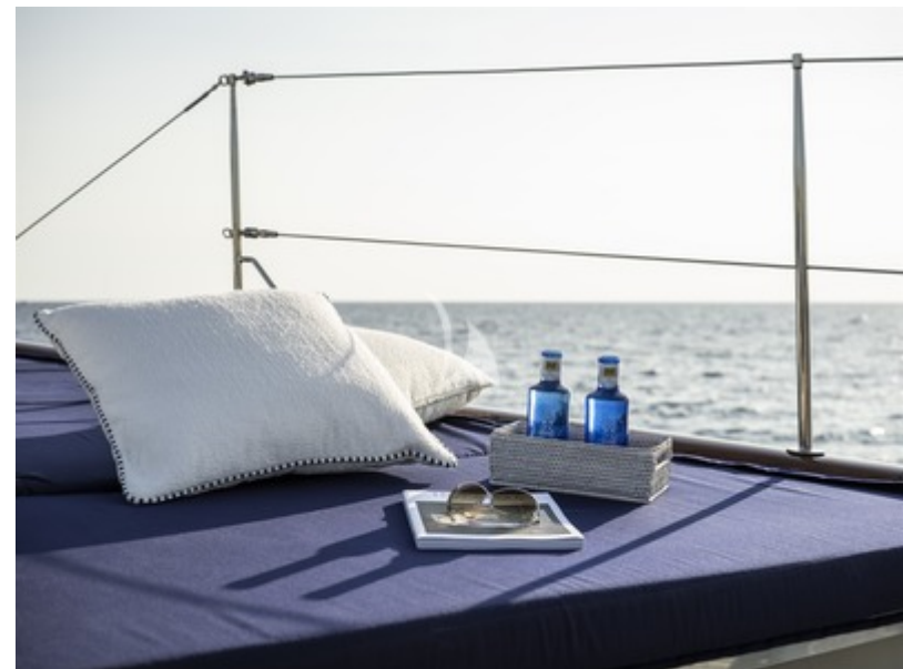
Bow lounging area