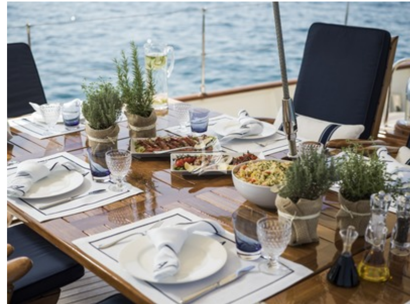
Lunch on the foredeck