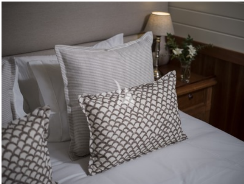
Master Cabin Detail