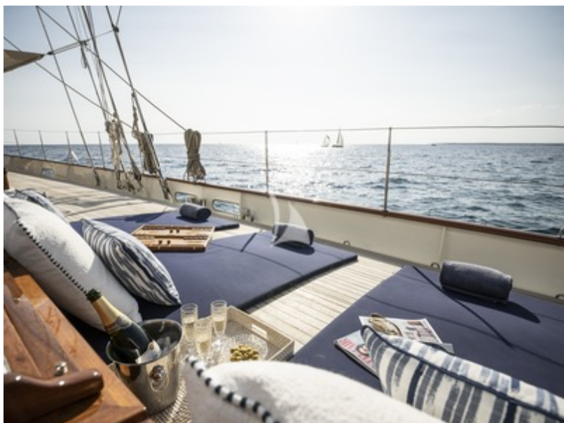
Side Deck Lounging