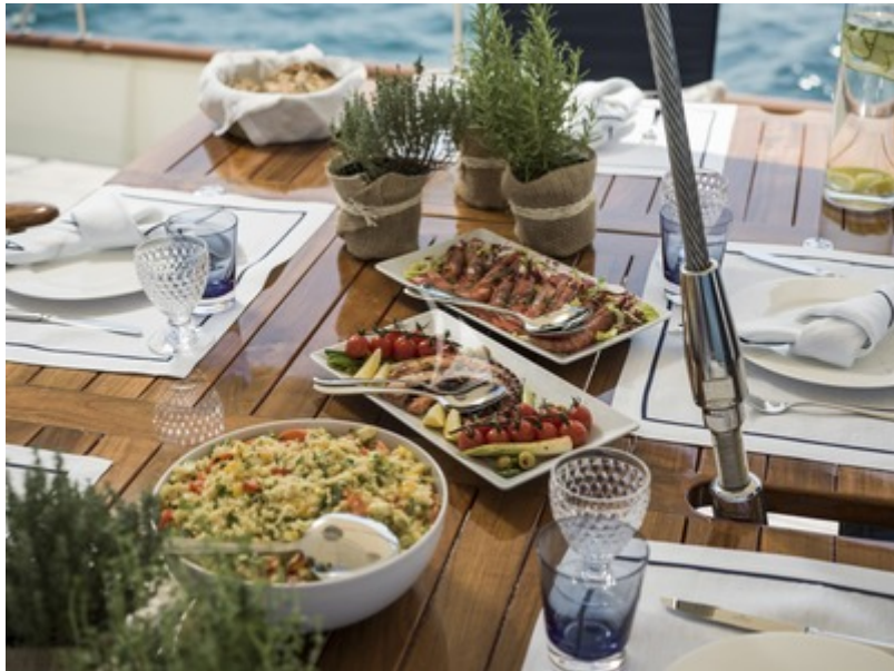
Lunch on the foredeck