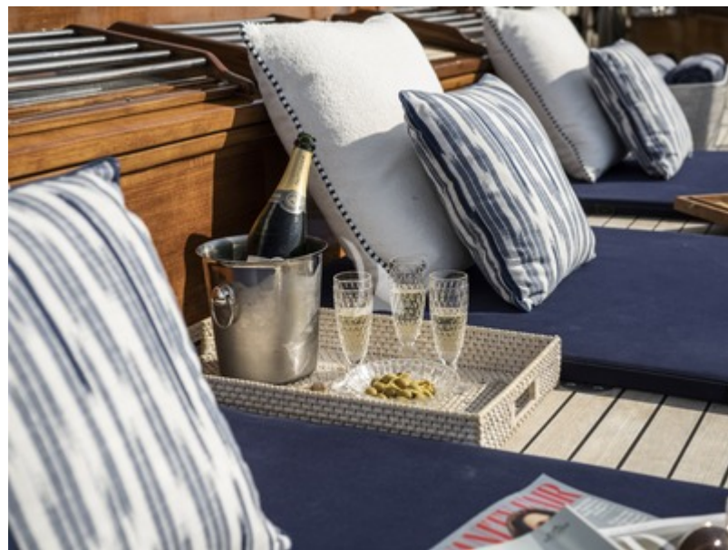
Side Deck Lounging