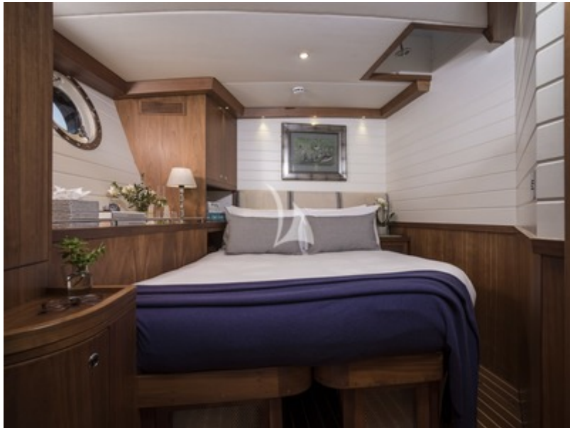
Double/Twin Cabin 1