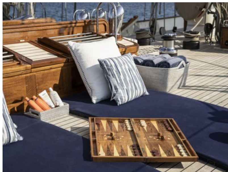
Side Deck Lounging