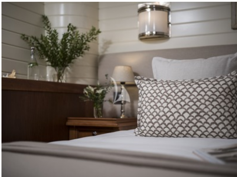
Master Cabin Detail