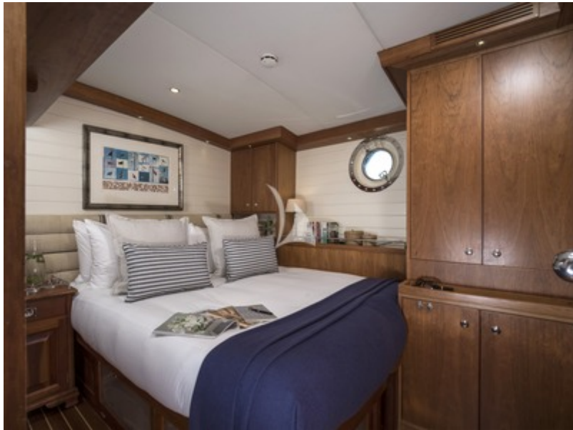
Double/Twin Cabin 2