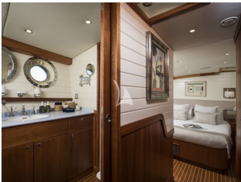
Master Cabin and Ensuite