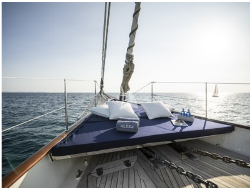
Bow lounging area