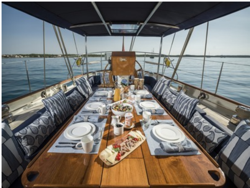
Breakfast Table - Cockpit