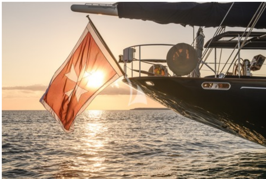
Sunset at anchor