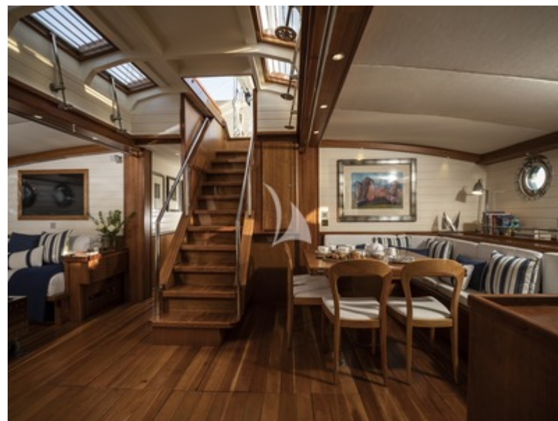
Saloon looking Aft