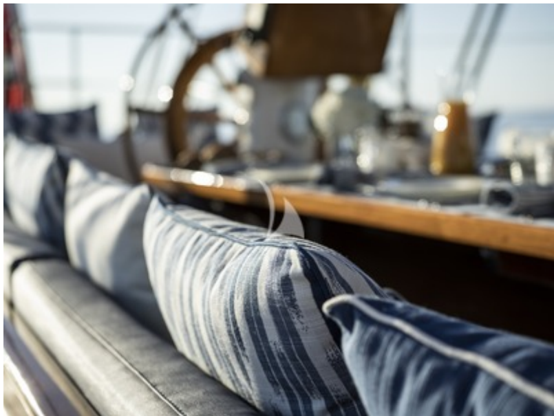
Cockpit seating detail