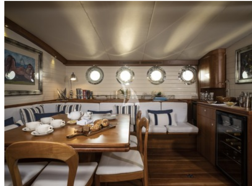
Saloon Dining Area