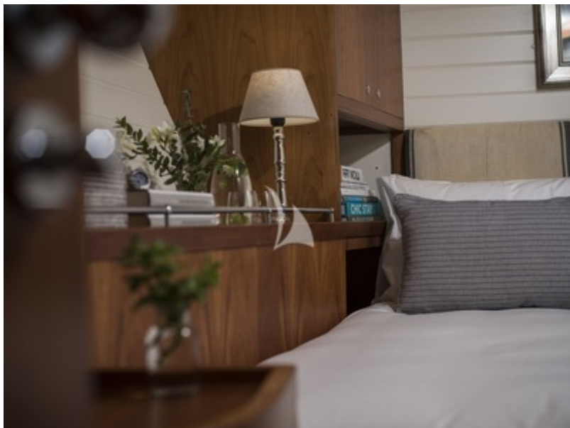
Double/Twin Cabin Detail