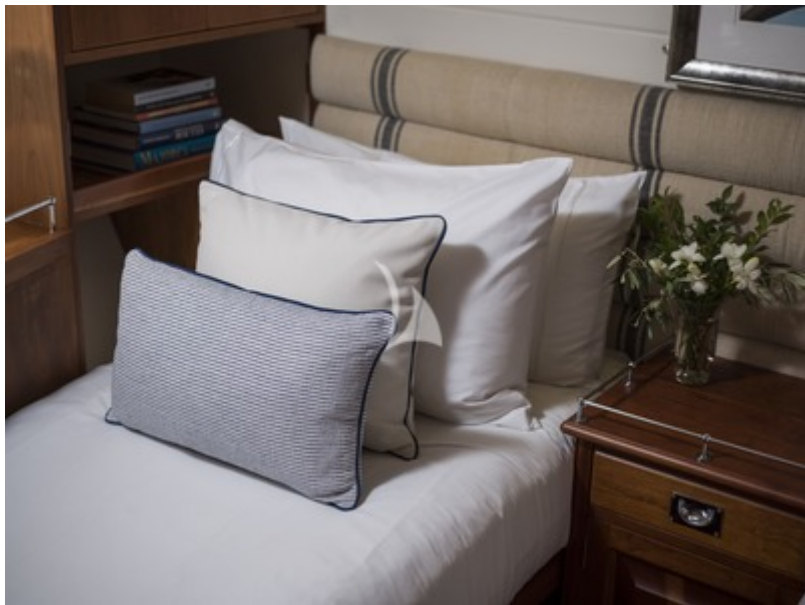
Children's Cabin Detail