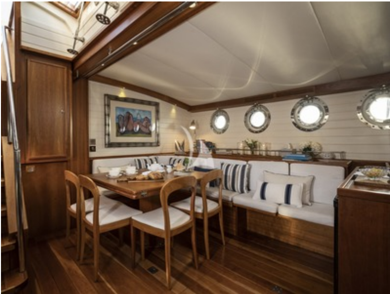
Saloon Dining Area