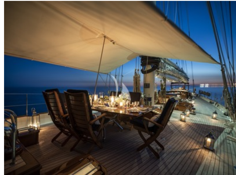
Nightfall on the foredeck