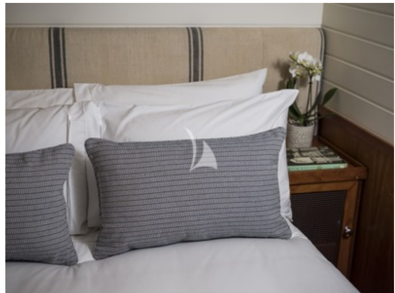
Double/Twin Cabin Detail