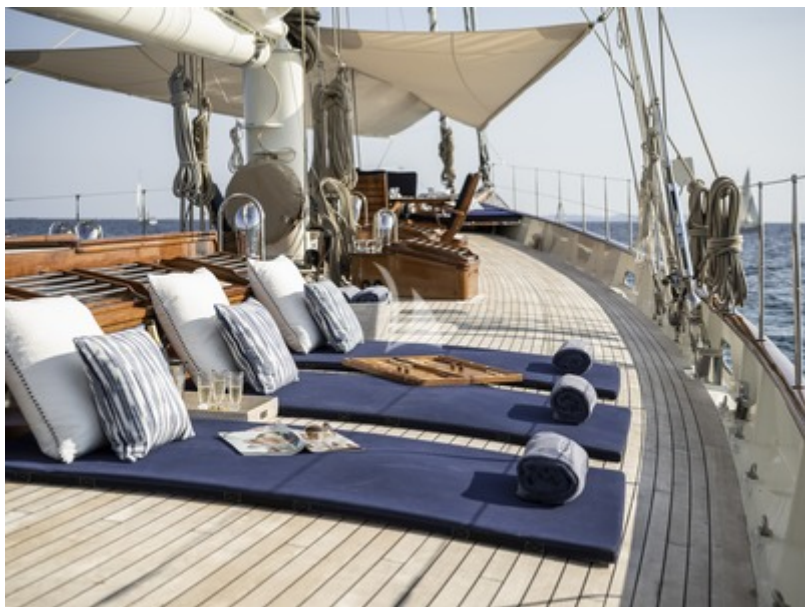
Side Deck Lounging