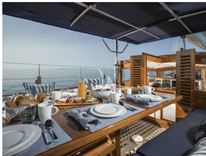
Breakfast Table - Cockpit