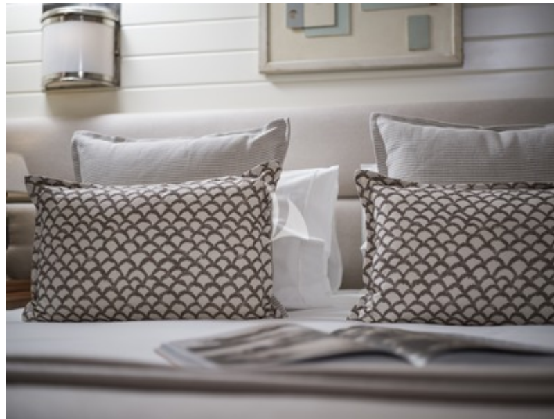
Master Cabin Detail