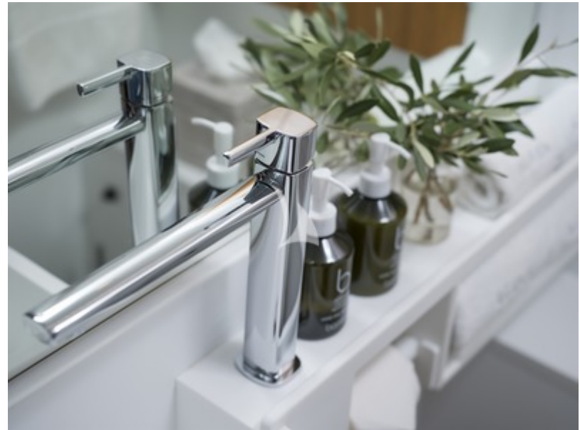
Guest Ensuite Detail