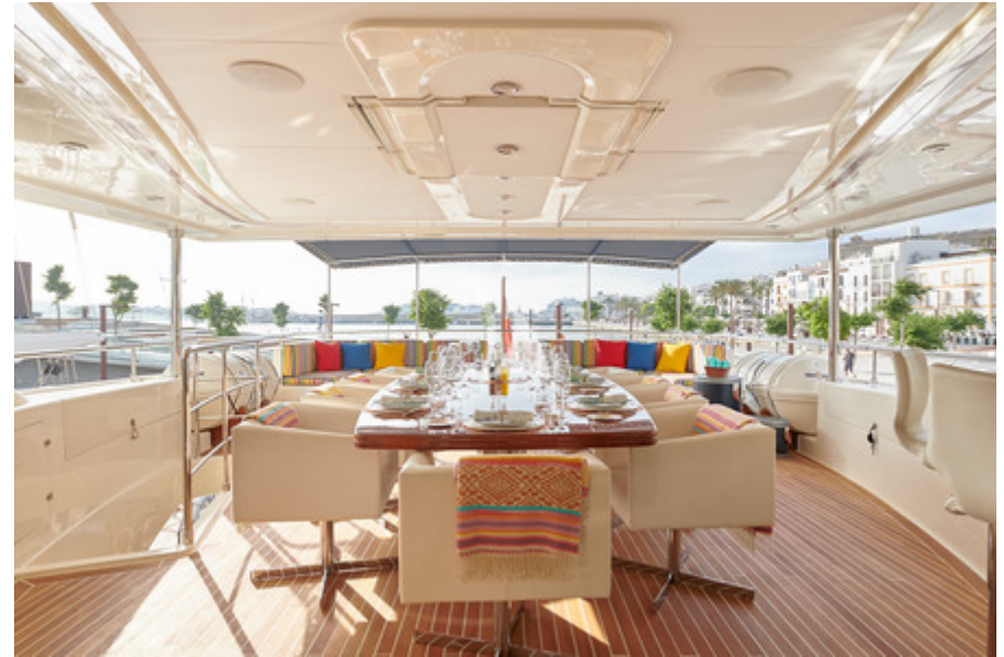
Bridge deck dining