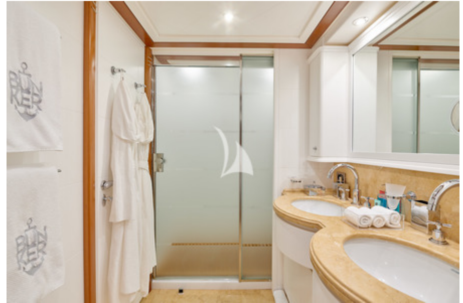
VIP 1 bathroom