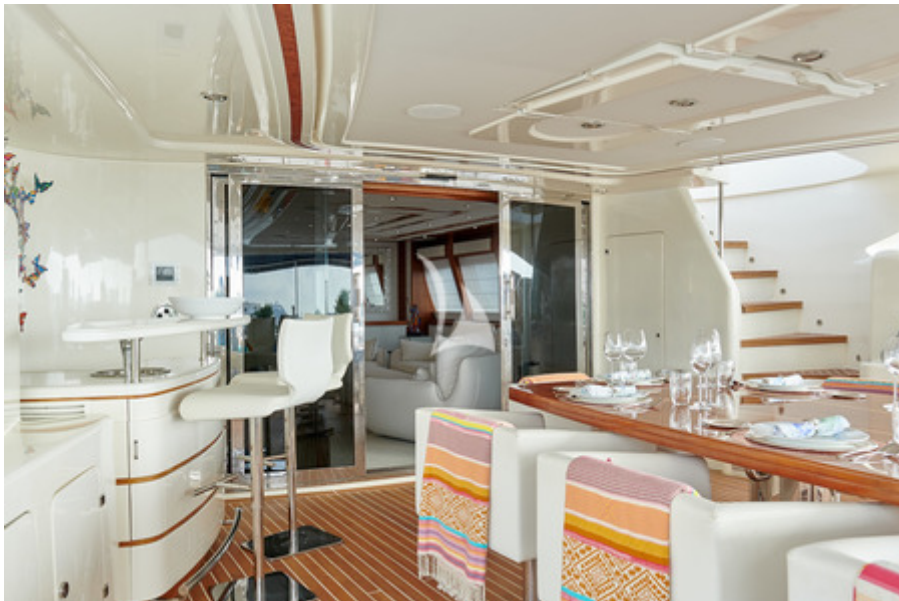
Bridge deck bar