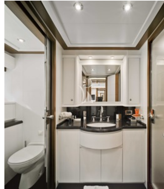
Twin 1 bathroom