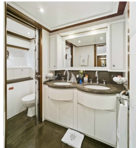
VIP 2 bathroom