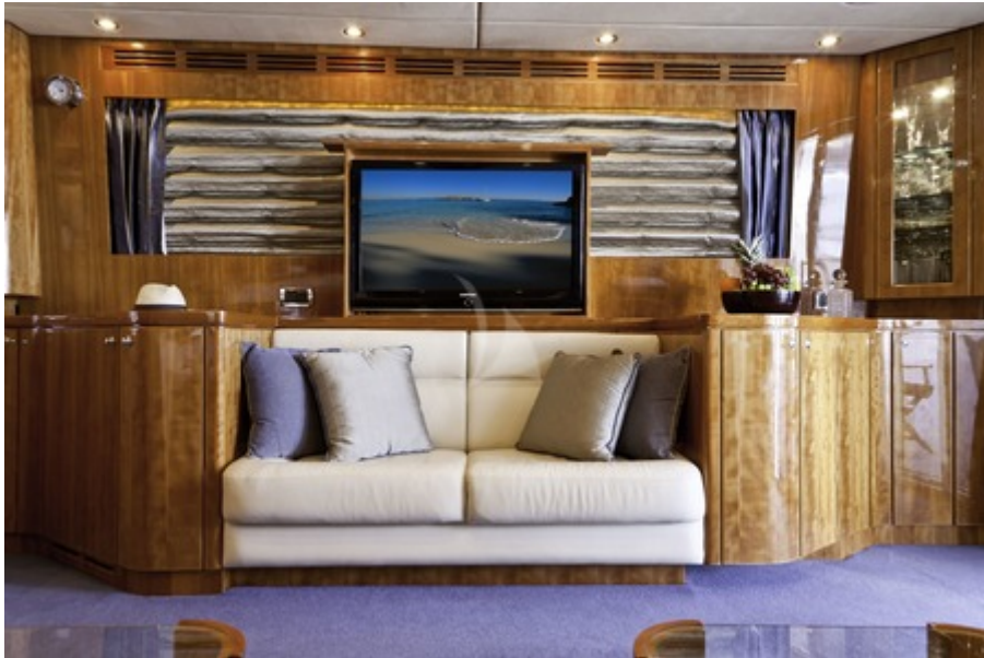
Saloon with TV