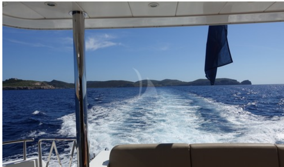
Aft deck underway