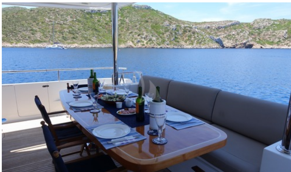
Al Fresco dining