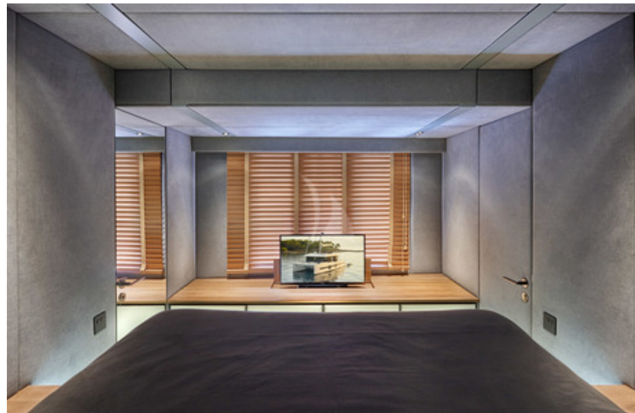
VIP cabin 2