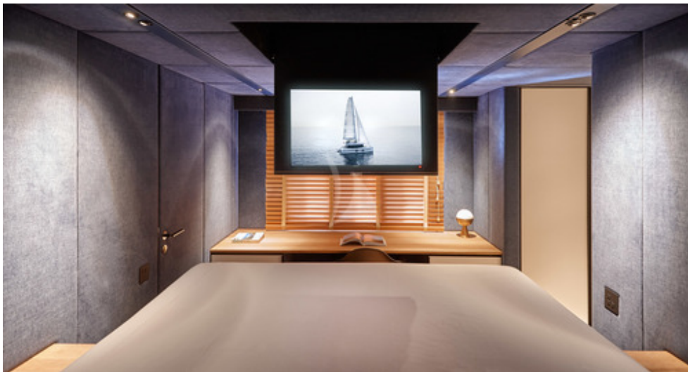
VIP cabin 1