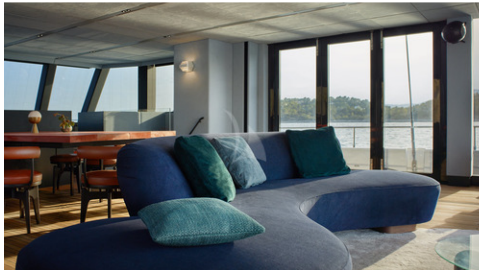
Salon couch (layout one)