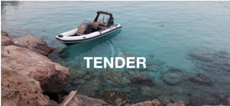
Tender (summer only)