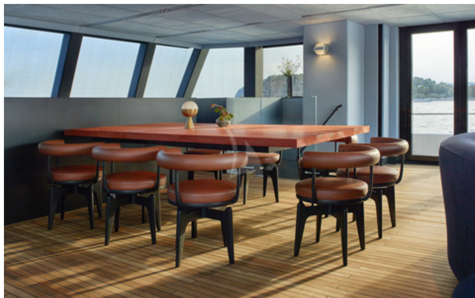
Dining (layout one)