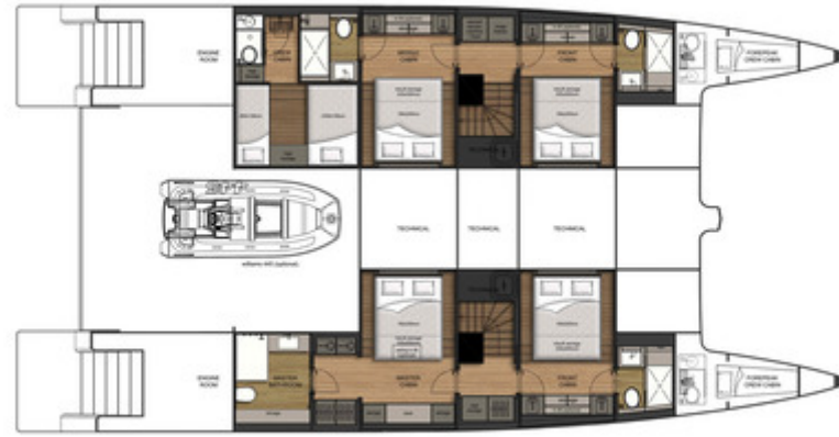
Layout (lower deck)