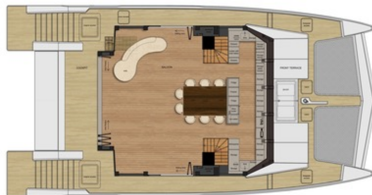
Layout (main deck)