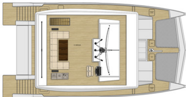
Layout (top deck)