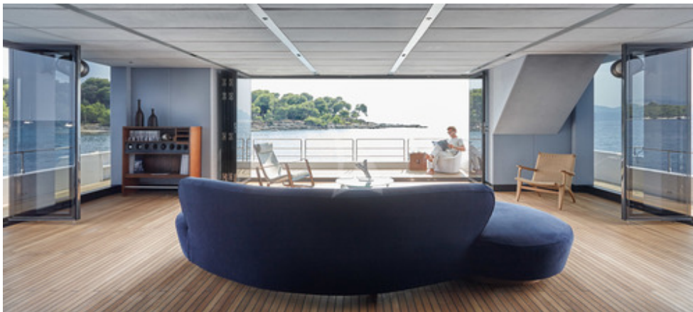
Salon (layout one)